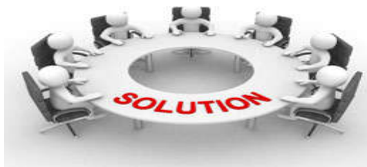
Figure 3: Democratic Leadership

Anderson (1959); Klinker (2006) and Teles (2015); identified the democratic leader as an individual who shares decision making with the other members and therefore, democratic leadership is connected with higher morale in the majority of the situations. Allmendinger and Hackman (1996) supported Anderson's explanation of the relationship between democratic leadership and productivity. Although the significant drawbacks to democratic leadership are time consuming activities and lengthy debate over policy, participation plays a key role for increasing the productivity of leadership (Denhardt & Denhardt, 2003). The democratic leadership style is also called the participative style as it encourages employees to be a part of the decision making.